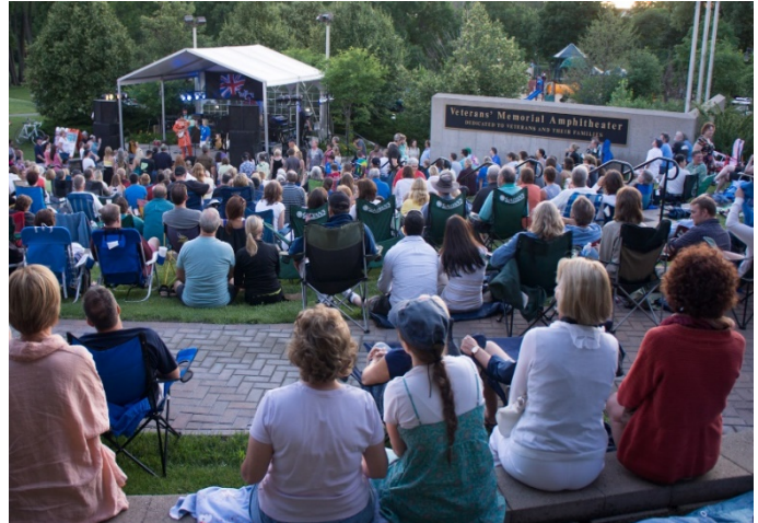
Summer concert series at the Wolfe Park Veterans Memorial Amphitheater

The breadth of programs and broad support for the arts by Friends of the Arts and the city is a result, in large part, of advocates from the community and within city government, and the strong relationships that have formed. To ensure the long-term stability of arts and culture in the community, the city and Friends of the Arts are working together to determine where efforts should be focused, how to express and communicate its importance to community vitality, and building cross-sector support and partnerships. Guided by the knowledge that arts and culture are a key contributor to economic and community development, this framework will enshrine past efforts and offer a strategic path to approach arts and culture as a tool in solving community challenges and developing policy on which the future of arts and culture in St. Louis Park will grow.