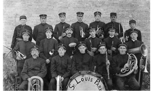
The St. Louis Park Village Band in 1903