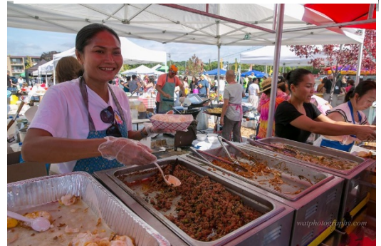
The inaugural Thai Street Food Festival